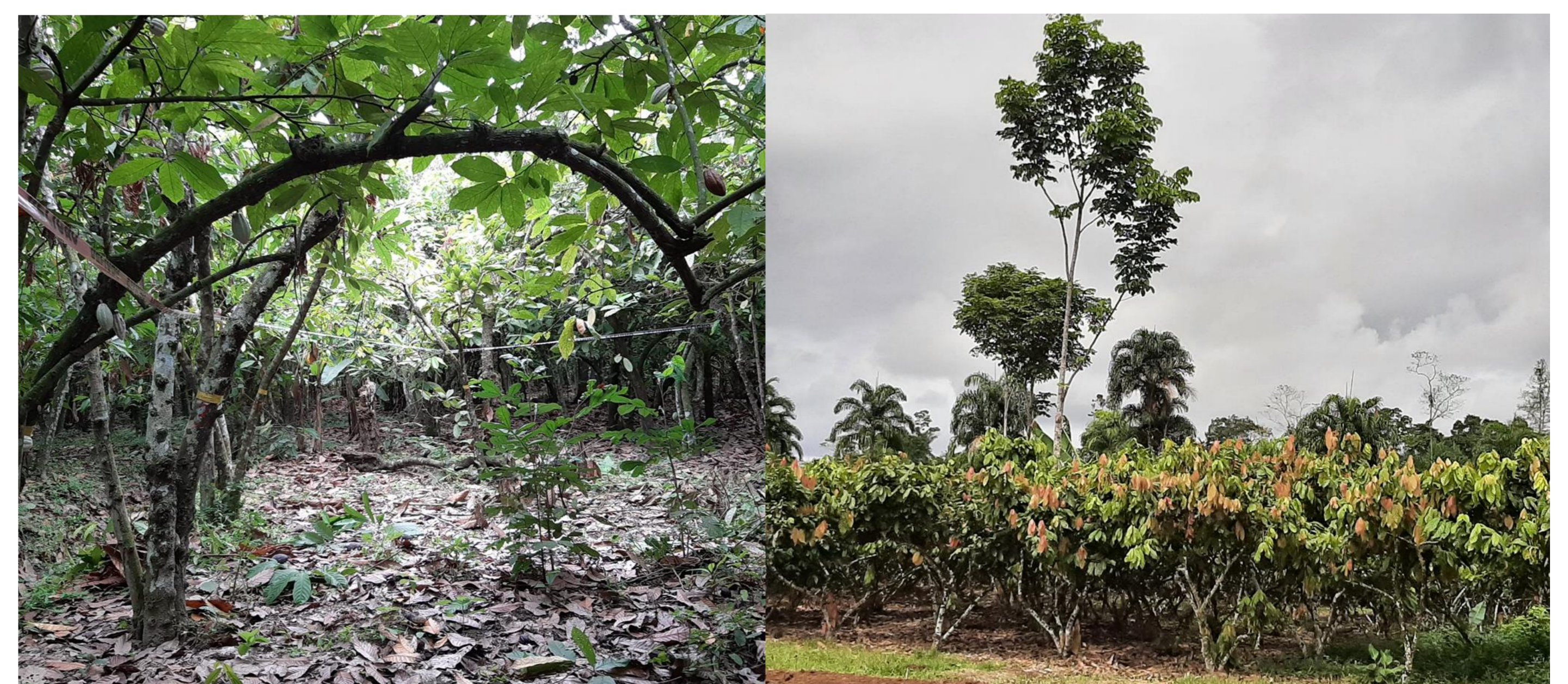
Figure 2. Organic agroforestry farm in the Guayas province of Ecuador on the right, agroforestry long-term field experiment in the Ecuadorian Amazon (INIAP).