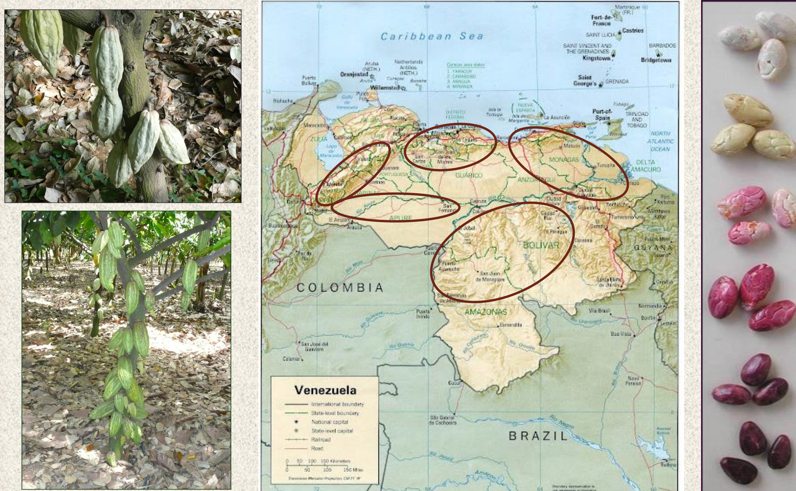
Figure 1. Map of Venezuela by states, indicating the cocoa-producing areas.

The samples are selected considering the trajectory of the different production units or official organizations associated with cocoa throughout the country.