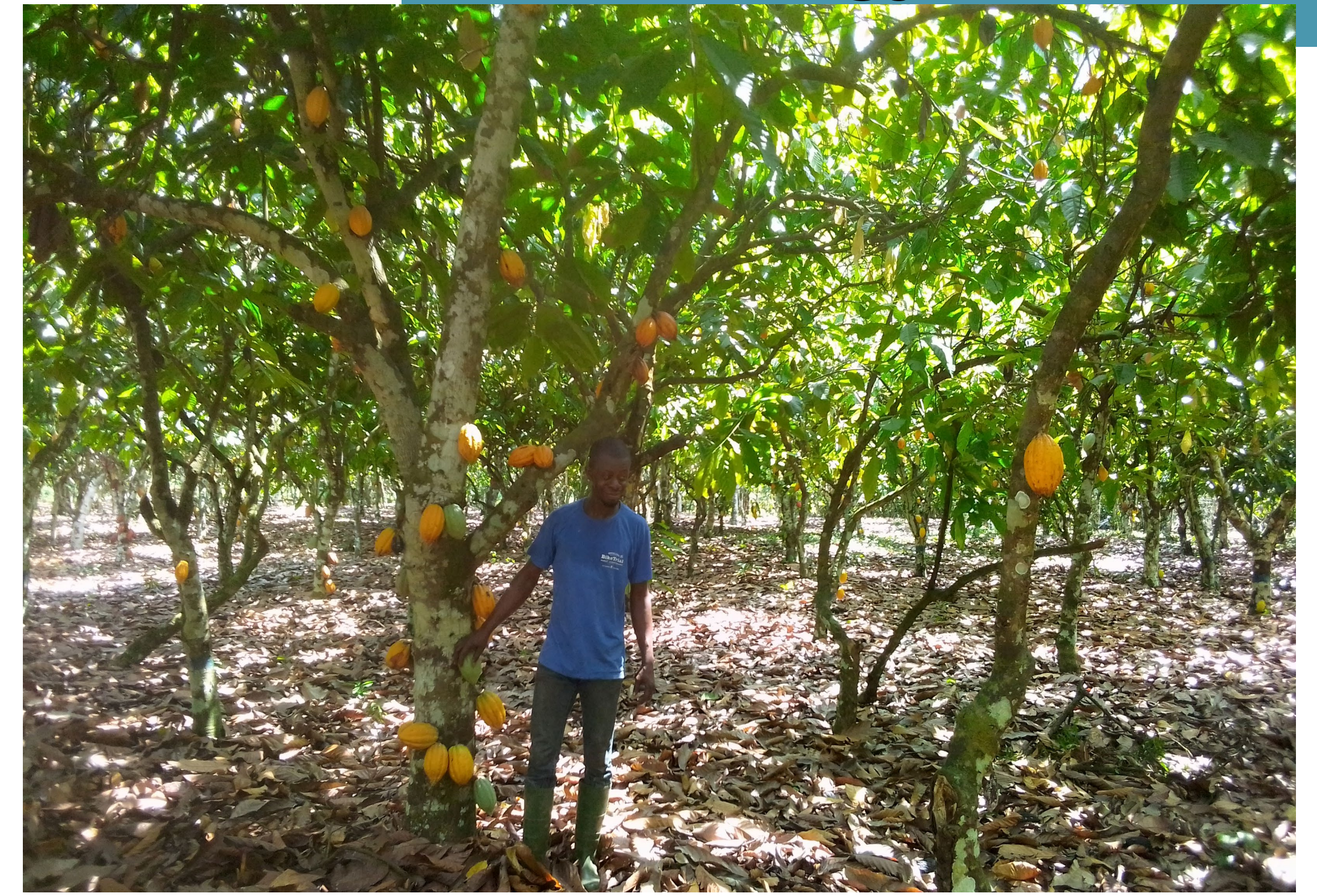
Photo 1: Highly competitive cocoa tree influencing the diameter of its neighbours.

The genetic improvement of cocoa in Côte d'Ivoire is based on the selection of clone hybrids in comparative hybrid trials. The selection criteria have always been production, bean quality and resistance to diseases and insects. Competition between trees for resources, although having an effect on the selective value of individuals, has never been taken into account in this program. The aim of this study was to understand the dynamics of intraspecific competition over time in two cocoa populations planted in Côte d'Ivoire.