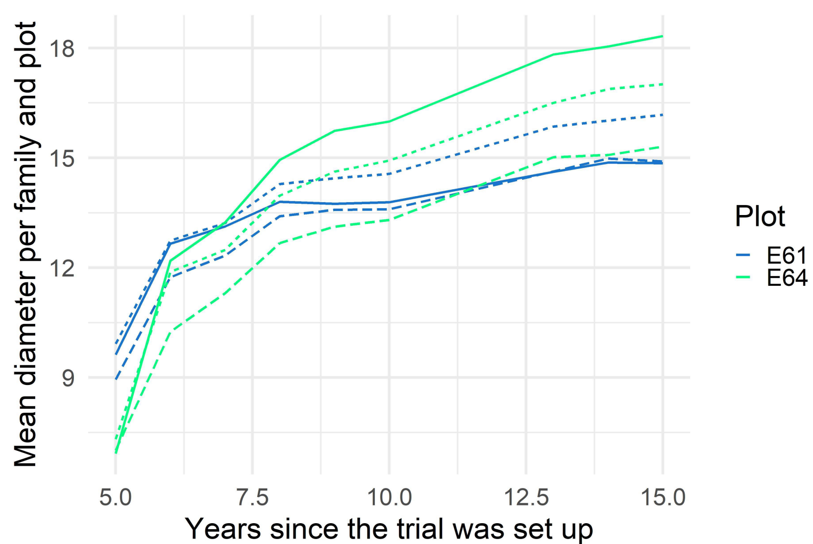
Fig 1: Comparison of diameter of control families present on the 2 plots.

No significant difference between plots ( P=0,42 )