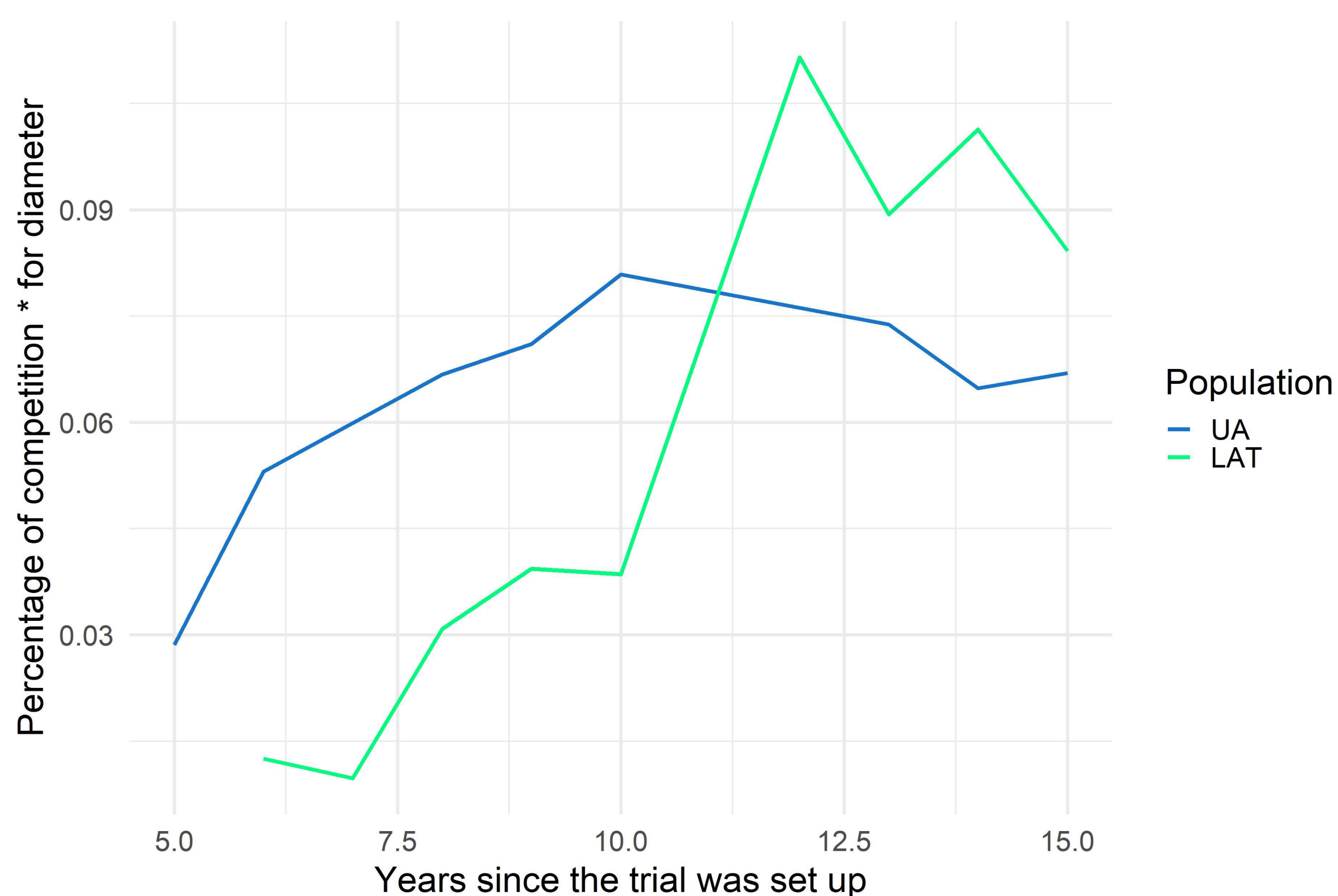
Fig 2: Dynamic of percentage * of competition per population and year

* Percentage of competition is expressed as the diameter variance explained by competition related to the variance explained by the model